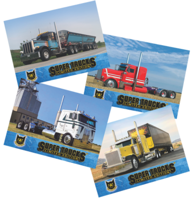
Sneak Peek Series 24 Cards