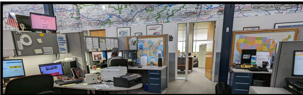
Our Help Desk is open 24 hours a day, 7 days a week to assist you.